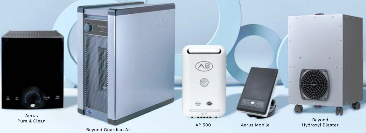
Aerus Pure & Clean